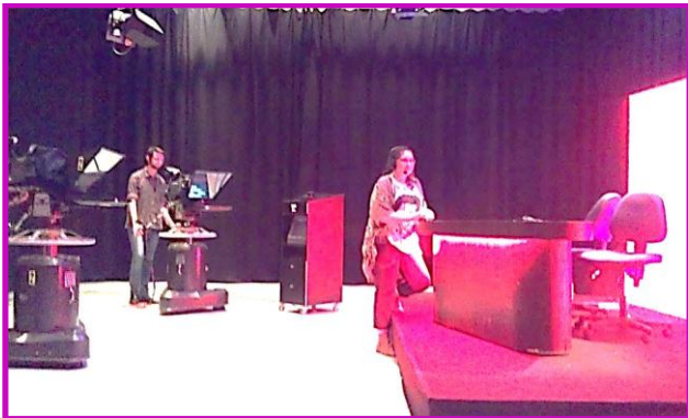
Pictured: Deakin students working in their Television studio.